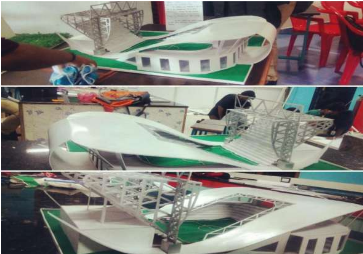
Our Students Model Making for National Level Technical Symposium RECONIN 2K17

Tamil New Year: Our College celebrated Tamil New year on 13 th April 2018 . The Tamil New year festival is popularly called Puthandu. It is the celebration of the first day of the traditional Tamil calendar. The day is marked with feast and decorated with kolams. Special lunch was served to all as a part of celebrations.